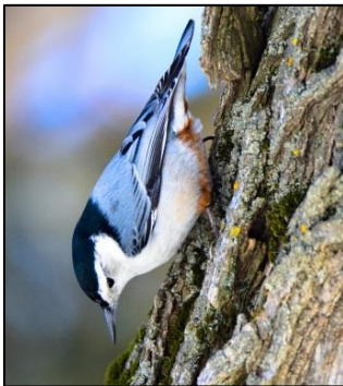
White-breasted Nuthatch Bob Godwin

Saturday, February 2 - Chickadee Pishing Saturday, March 16 - Owl Pellet Dissection Saturday, April 13 - Birdhouse Workshop Saturday, May 4 -Pike Lake Field Trip